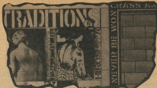
A SECTION OF THE SLEEVE