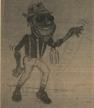
A drummer's eye view of the STAR of the show — this time the band in question is THE DEFENDANTS.