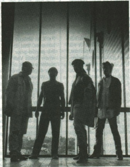
TEN MILES HIGH