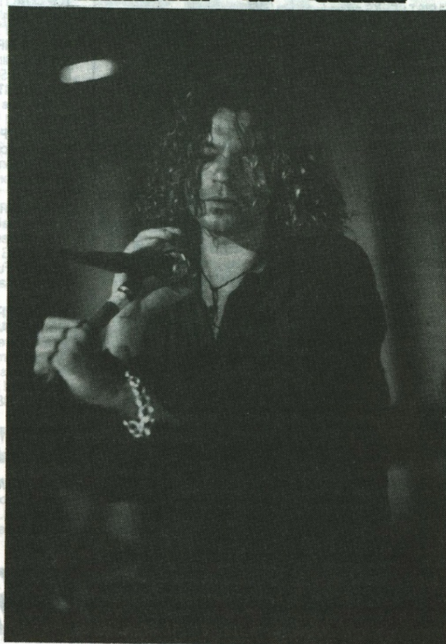
MICHAEL HUTCHENCE OF INXS AT THE AVLC.