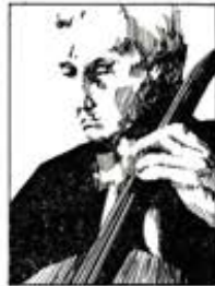
The Mordaunt-Short range of quality loudspeaker systems (£29.15 - £90.75, inc. V.A.T.)

Amid the wealth of accomplishment of audio technology world-wide, the design of quality loudspeaker systems remains uniquely a sphere of British eminence. Whether you be primarily music-lover, high-fidelity enthusiast or home-maker, these superlative products have a great deal to offer you.